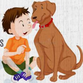
Interactions with Animals