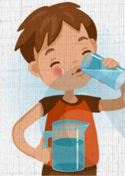
Drink Clean Water