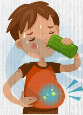
Drinking Dirty Water