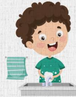
Keep Hands Clean